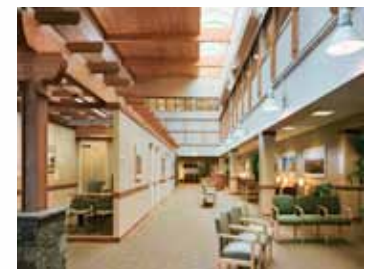
THE CENTER: ORTHOPEDIC AND NEUROSURGICAL CARE AND RESEARCH Bend, Oregon