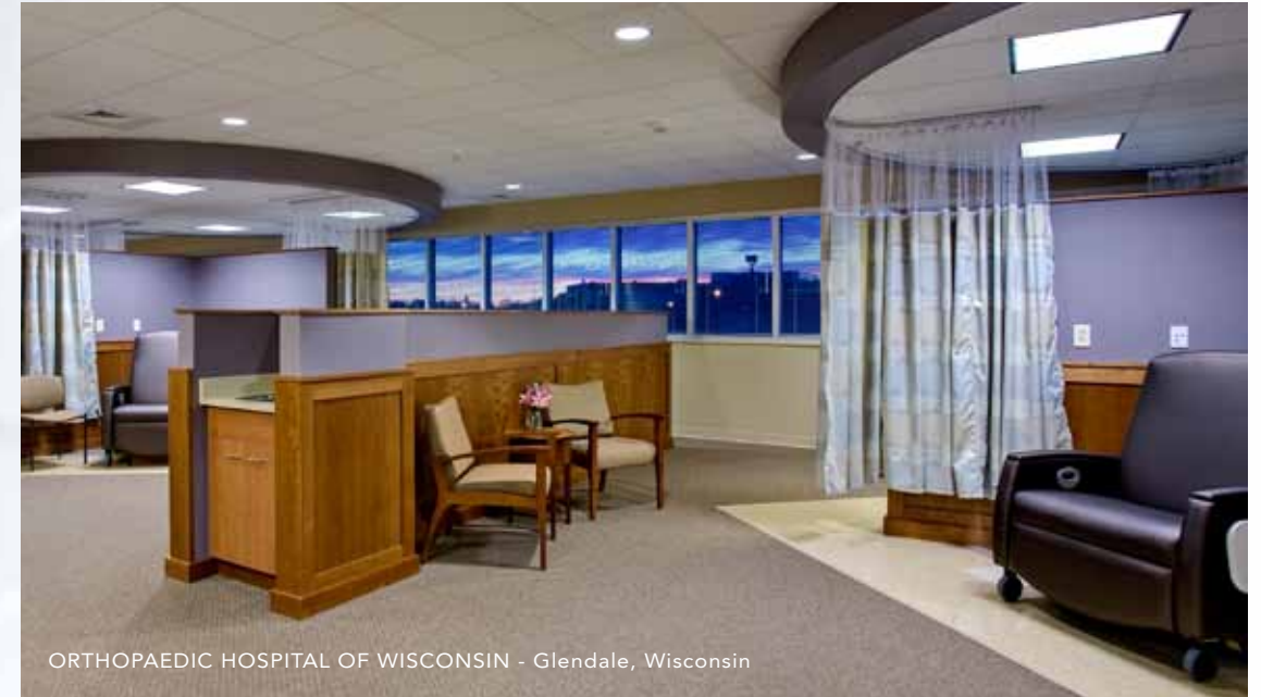
ORTHOPAEDIC HOSPITAL OF WISCONSIN - Glendale, Wisconsin

Our streamlined approach helps our clients successfully deliver world class care in a comforting environment.