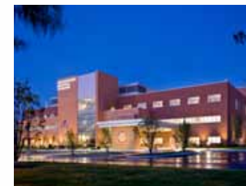
ORTHOPAEDIC HOSPITAL OF WISCONSIN Glendale, Wisconsin