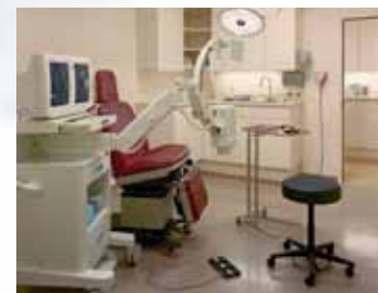
THE CENTER: ORTHOPEDIC AND NEUROSURGICAL CARE AND RESEARCH Bend, Oregon

We have the expertise in specialty healthcare design, state-of-the-art technology and improvement in space flow to advance the quality of orthopedic care. Our design professionals create a welcoming environment that marries comfort with care. We are widely recognized for our expertise in planning, designing/building, developing and managing medical spaces that enhance comfort and healing for orthopedic patients and their families.