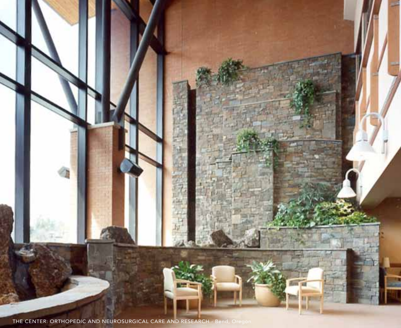
THE CENTER: ORTHOPEDIC AND NEUROSURGICAL CARE AND RESEARCH - Bend, Oregon