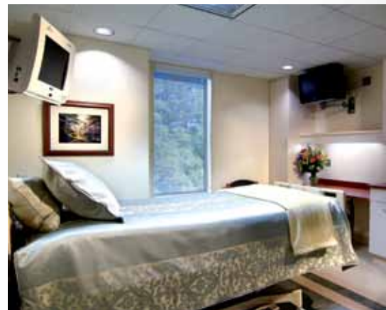
JOHN D. ARCHBOLD MEMORIAL HOSPITAL CARDIAC & VASCULAR DISEASE CENTER Thomasville, Georgia