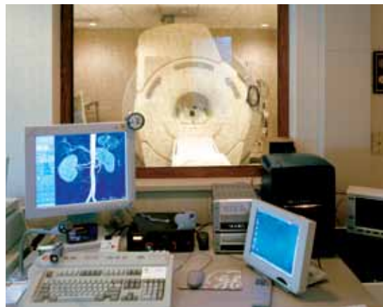
OKLAHOMA HEART INSTITUTE, SOUTH POINTE MEDICAL PARK Tulsa, Oklahoma

We have specialized expertise to integrate advanced technology into the healing environment while creating a welcoming and efficient space for patients, physicians and staff. We are widely recognized for our expertise in planning, delivering, developing and managing spaces that enhance comfort and healing for cardiac patients and their families.