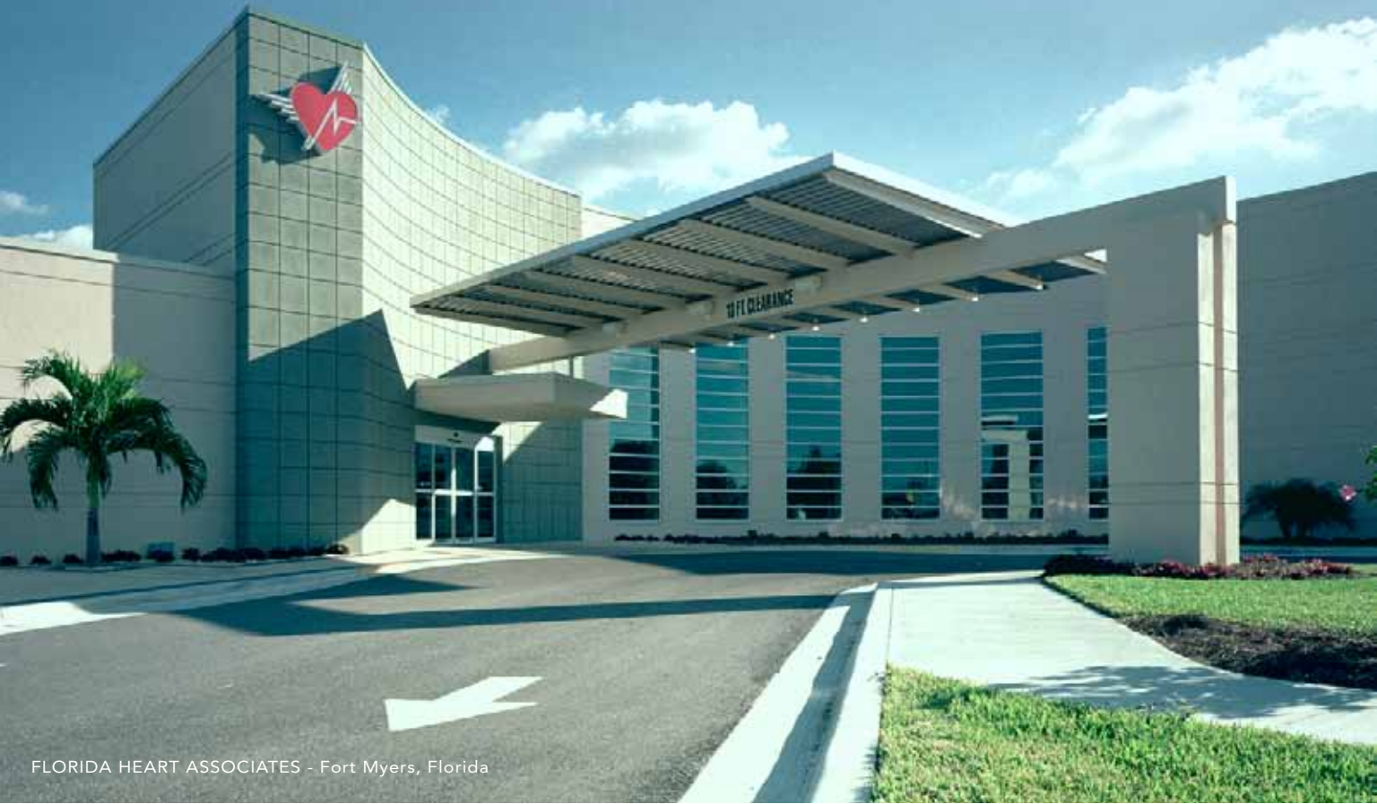
FLORIDA HEART ASSOCIATES - Fort Myers, Florida